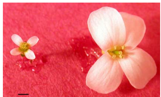
Figure 2. Floral morphological diversity in the genus Arabidopsis. Left, Arabidopsis Col-0 accession. Right, Arabidopsis halleri subsp. gemmifera , collected in Osaka. This self-incompatible species has large petals to attract pollinator insects, and the anthers are separated from the stigma to avoid autopolination. Scale bar = 1 mm.

Alternatively, researchers can exploit the high level of available molecular genetic information and use a candidate gene approach. With this method, genes that are known to affect a trait may be examined for